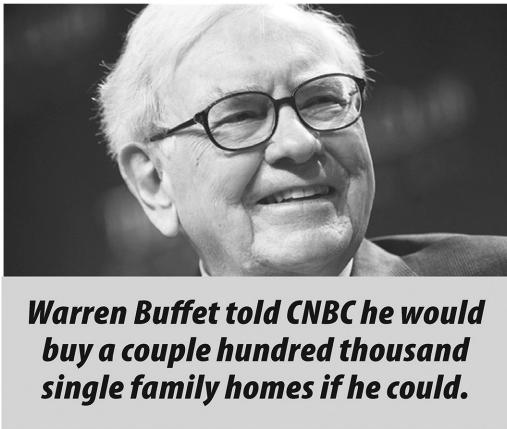
Warren Buffet told CNBC he would buy a couple hundred thousand single family homes if he could.

They will reveal these breakthrough strategies at the FREE events in the Vancouver area. When