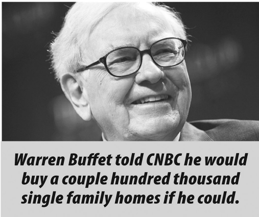
Warren Buffet told CNBC he would buy a couple hundred thousand single family homes if he could.

They will reveal these breakthrough strategies at the FREE events in the Vancouver area. When