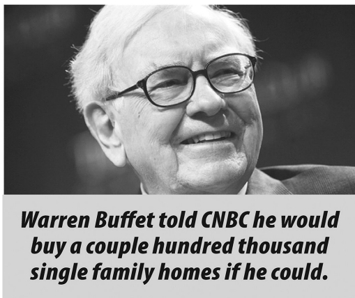
Warren Buffet told CNBC he would buy a couple hundred thousand single family homes if he could.

They will reveal these breakthrough strategies at the FREE events in the Vancouver area. When