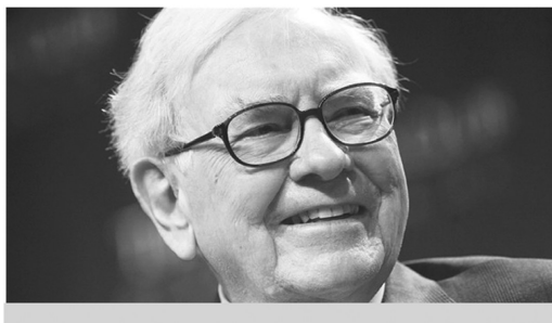
Warren Buffet told CNBC he would buy a couple hundred thousand single family homes if he could.

They will reveal these breakthrough strategies at the FREE events in the Vancouver area. When